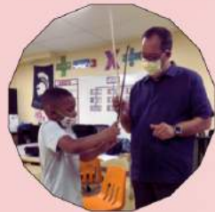
...and music, of course!

In summer 2021, we held an in-person summer camp filled with learning, laughter, and of course, music! Thanks to support from Say Yes Buffalo and the Children's Foundation of Erie County , we were able to provide 6 weeks worth of programming for 60 students, employ 22 teachers and 6 staff members, and host a combined 11 interns and volunteers.