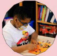
...crafts & snacks...