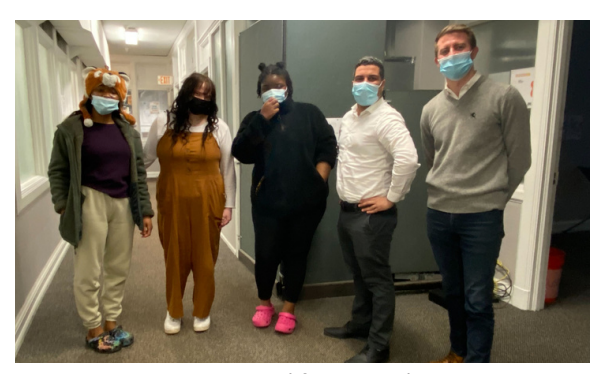
Journey's End first BSW class!

Journey's End is an organization that provides resources and mentorship for the young-adult refugee community in Buffalo. This past February, several BSW Teaching Artists traveled to the West Side Community Services Center to share music and offer hands-on introductions to string instruments. Our Teaching Artist ambassadors connected with the Journey's End mentees quickly, and we soon realized that a pilot program would be a great way to continue the teaching